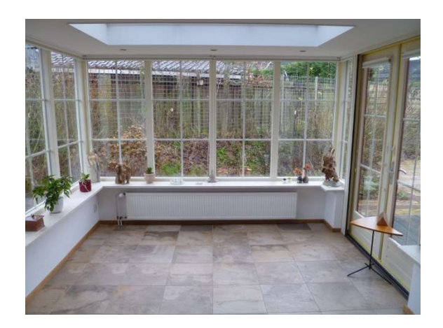
Figure 2: The empty conservatory with indicated the energy lines of the Hartmannand the Curry nets

When a space is completely in harmony, the Left Polarity is equal to 0 and the Vortex value and Right Polarity are approximately equal and have a value between 12 and 16. Ten years ago, the value 12 Vortex / 0 Left / 12 Right was considered to be completely in harmony. Nowadays, spiritually developed people also experience higher values as harmonious.