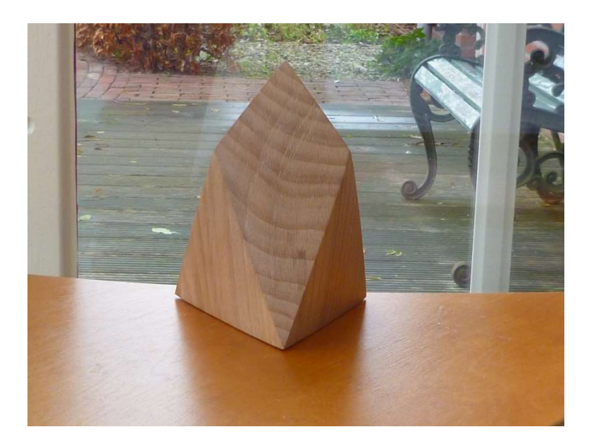
Figure 1: Chestahedron Beechwood in the most powerful position

Subject: The energetic effect of a Chestahedron