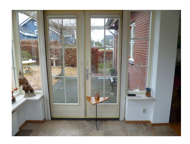
Figure 3: The Chestahedron on the table exactly in the middle of the West side of the conservatory